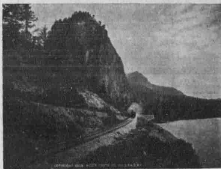
COLUMBIA RIVER—THE NORTH BANK ROAD

In Connection With the Great Northern Ry. and Northern Pacific Ry.