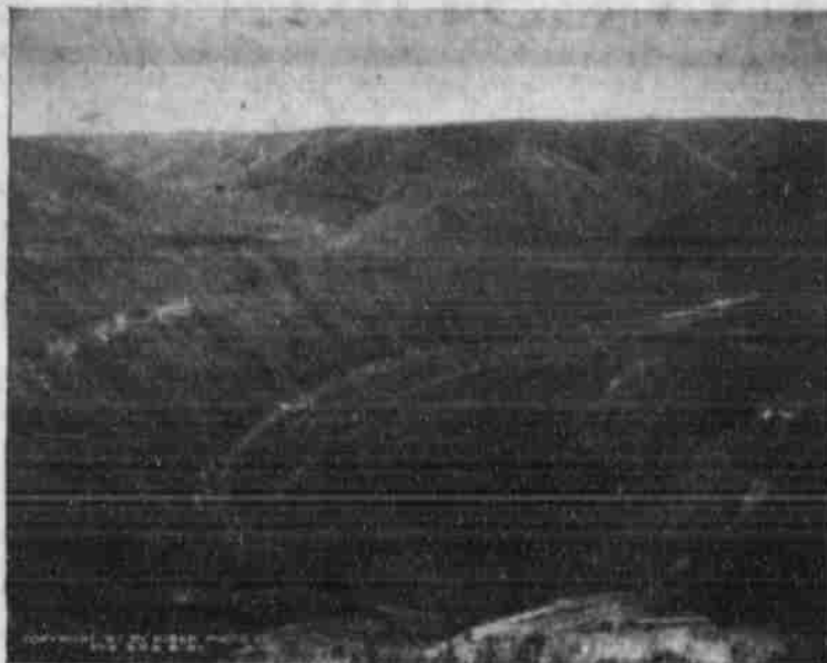
Horseshoe Bend, Deschutes River Canyon.