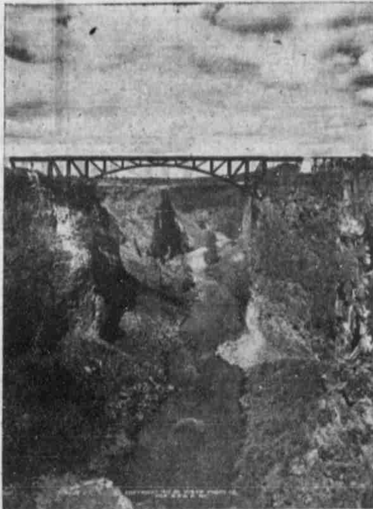
Bridge Over Crooked River, 25 Miles From Bend.