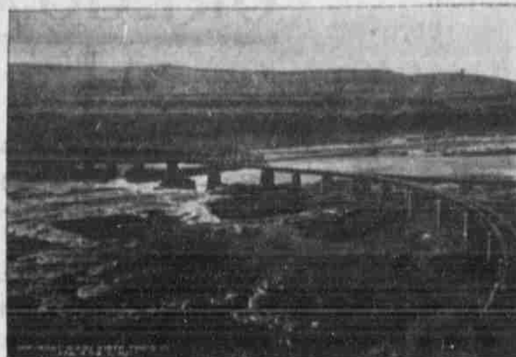
Where the Oregon Trunk Crosses the Columbia.