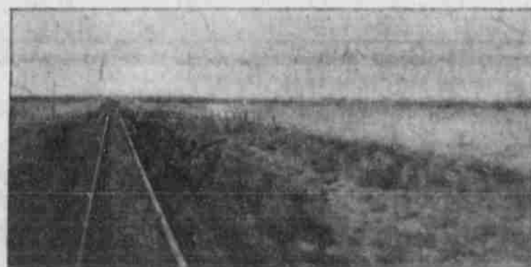
Agricultural Lands Along Central Oregon Railroad.