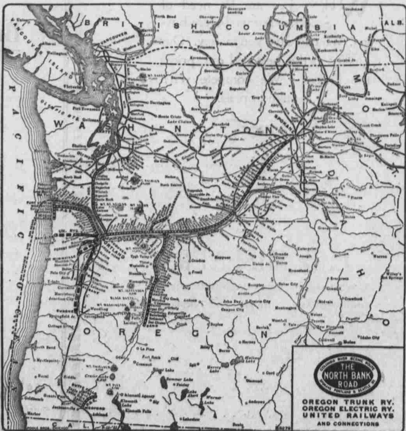
Map Showing Bend's Position in the Northwestern Railroad World.