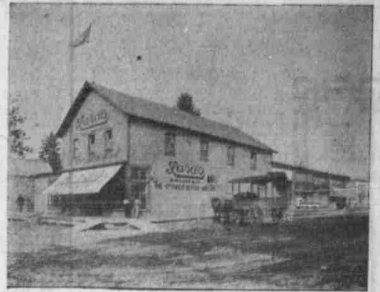
The A. M. Lara Store.