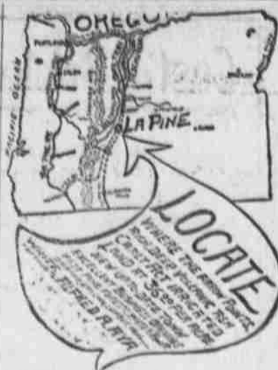
La Pine, Crook County, Oregon.

The first step, which will be undertaken at once, is the installation of two of the five units which will comprise the completed plant. Each unit, roughly speaking, is a separate water wheel, each with a direct connected generator of 250 kilowatts capacity. The present plant, which