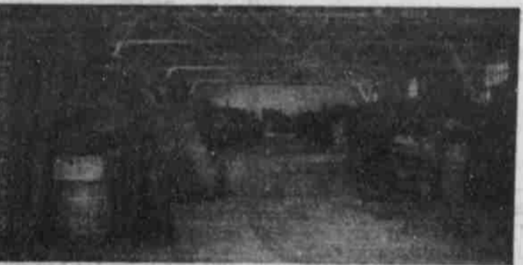
Warehouse Interior Before Freight Accumulated.