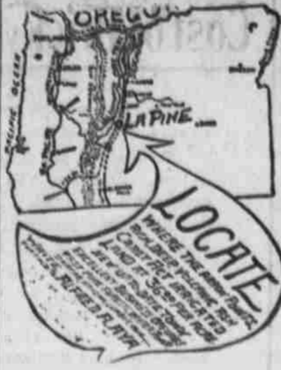
La Pine, Crook County, Oregon.