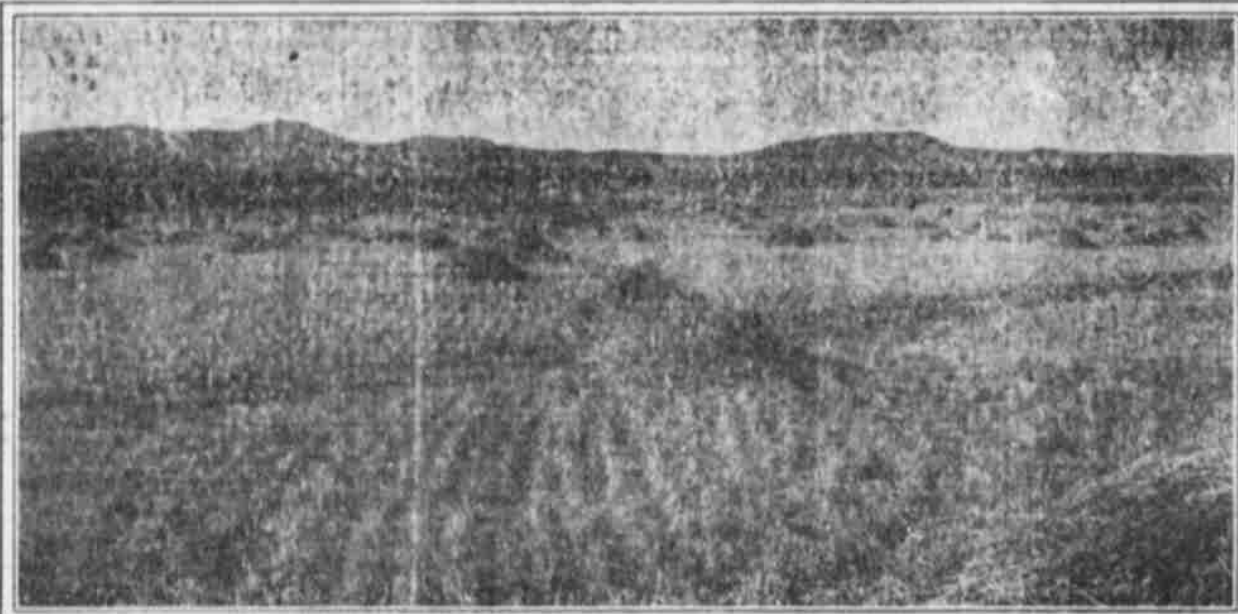
CENTRAL OREGON FARM SCENES.

hay. The accompanying illustrations show what can be accomplished. What some have done others can do also, and now with railway transportation affording the farmers quick outlet to the markets, there will be added impetus to agricultural developments in the Bend country.