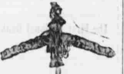
PERFUMED COAT HANGER.

Now don't say that you are sick and tired of the sight of coat and skirt hangers. Probably you have seen and made a number of them, but have you ever turned out a coat hanger like the one pictured? It is covered, to be sure, with the regulation flowered ribbon gathered along the edges of the frame,