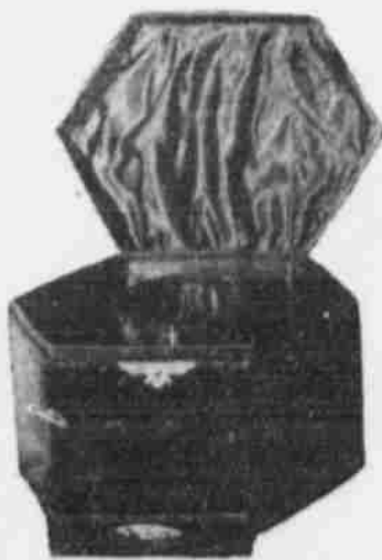
LEATHER COLLAR AND CUFF BOX.

Bags of endless kinds also may be manufactured. The leather box illustrated, designed for collars and cuffs, has a drawer for holding studs and