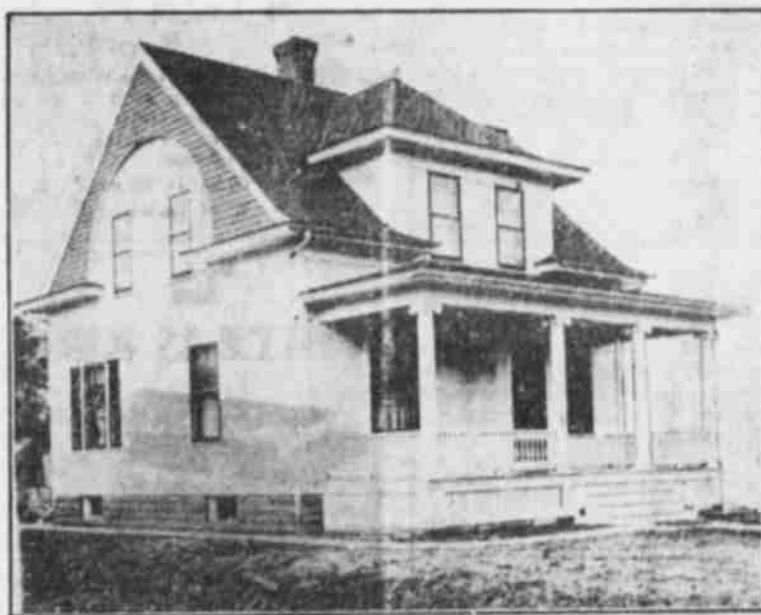
PERSPECTIVE VIEW—FROM A PHOTOGRAPH.