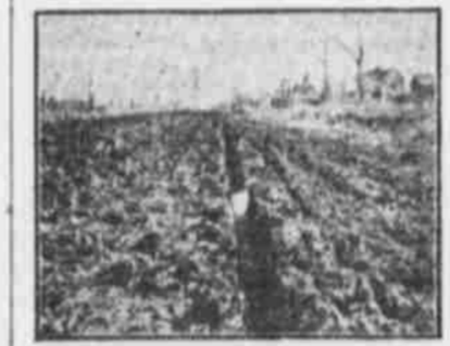
DIRT ROAD BEFORE DRAGGING.

The surface of the average country road should be covered in one round with the drag. One horse should be driven on the inside of the wheel track and the other on the outside, the drag being set by means of the chain so that it is running at an angle of forty-five degrees with the wheel track and working the earth toward the center of the road. In the spring, when the roads are more likely to be