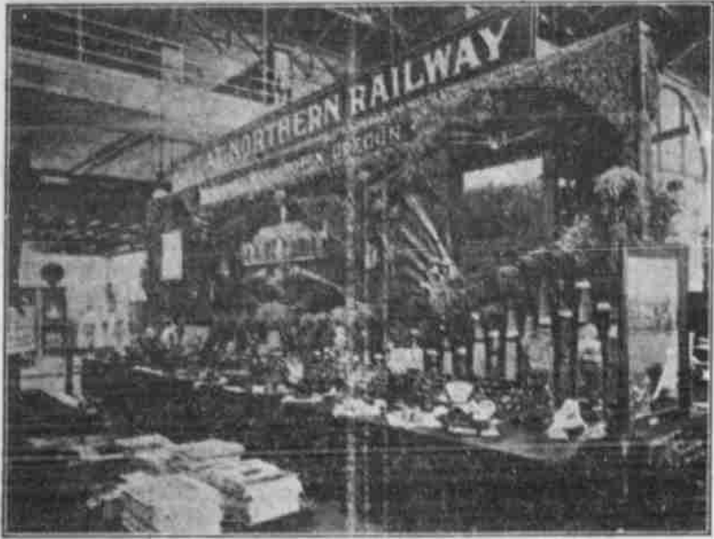
Boston Exhibit: 10,000 People a Day Look at It.

100,000 copies of literature were distributed describing the various districts. The Great Northern will start three exhibition cars on a circuit of Eastern States within the next two weeks.