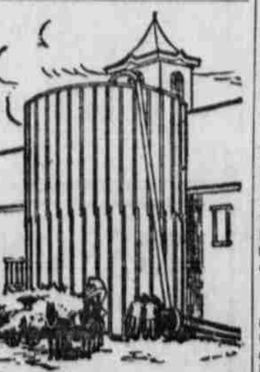
METHOD OF FILLING THE SILO.

Filling the Silo. How did you fill your silo last fall? The government people declare that while the blower, as shown in the picture, requires more power to operate than does the flat carrier, very few