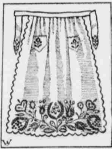
HUNGARIAN LINEN APRON IN BLUE AND RED.

The details of these stitches are shown, and they can easily be learned