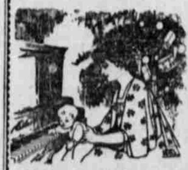
Find Santa Claus in Picture and

For every correct solution of this pus-, we will give. absolutely free, & Mu. ale Book, centaining 50 goed o d favorte National Songs, with words and music (only one book to each person) a so many other valuable prises free. Everyons should know these songs-send today. Directions Mark outlines of Santa Claus plainly, out adv. out, place in envelope, unclose stamp for reply and mail to our address below