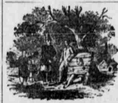
CHINERE WOODEN COLLAR

The mandarins (or rulers of towns) often sentence offenders to lie upon the ground, and to have thirty strokes of the bamboo. But the wooden collar is worse than the bamboo stick. It is a