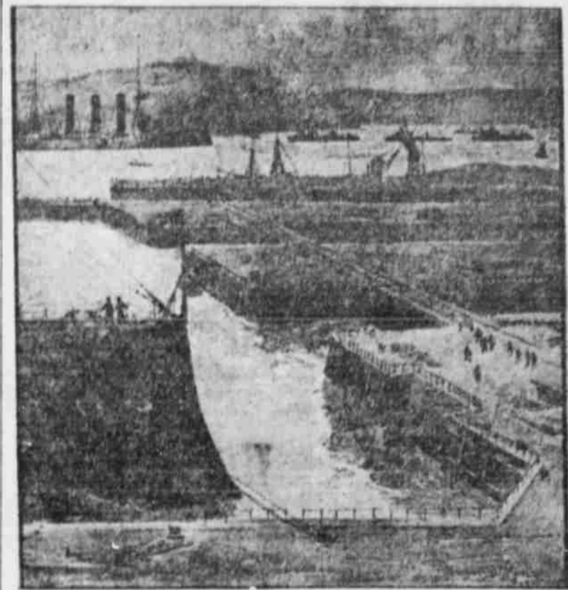
ENTRANCE LOCK TO NEW NAVAL DOCKS AT DEVONPORT.

England's new naval works here shown have made Devonport the best equipped and largest war port in the world. They include a fine tidal basin, with an entrance direct from the Hamoaze, and a closed basin, which has been provided with an entrance from the Hamoaze, which can be used for dry docking men of war. Devonport has now three new docks, which can take even the biggest men of war, apart from the entrance lock. It need hardly be pointed out that the final issue of naval warfare depends to a considerable extent on the rapidity with which the opposing nations can refit and replace on the active list battle ships and other war vessels damaged by the enemy. Thus the north extension of the dockyard at Devonport, which was opened by the Prince of Wales recently, must be reckoned among England's most valuable naval assets. The closed basin has an area of thirty-five acres; the extension covers nearly 120 acres. The total cost of the new work was about £4,500,000.