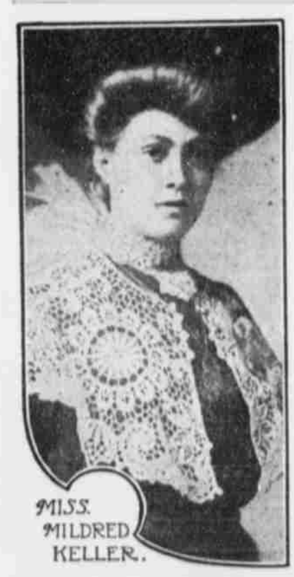
RESTORED TO HEALTH THANKS TO PE-RU-NA

They are ferocious animals and proy with great ferocity on clams. The process seems slow, but the limpet always gets there. He gets his cover over the unsuspecting clam and puts his big foot on his shell, generally on a weak spot. Then he whips out a long. wiry tongue and proceeds to bore a ard. hole in his captive. When this is done the shell files open, and the limpet is free to feast on the poor clam's carcass. He eats but a part and leaves the rest for the fishes of the sea.