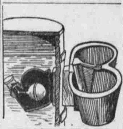
SECTIONAL VIEW OF THE WATERER.

No matter how pure a source of supply may be at hand for watering stock, if it is pumped into an open trough and left exposed for any length of time it soon becomes polluted and unfit for the animals to drink. This will not be the case, according to the inventor, if the stock watering apparatus here shown is put into use. If pure water is furnished to the tank or barrel to which this fountain is attached it is claimed that there is no way by which the animal that is drinking can make it foul. The waterer consists of a double drinking