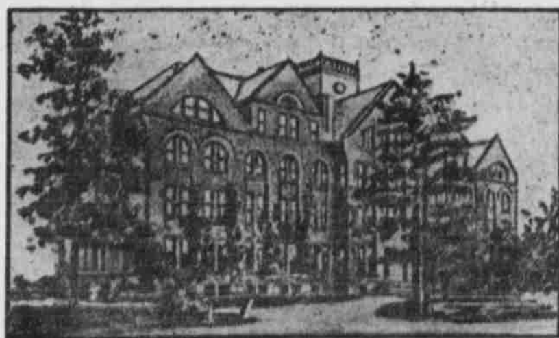
Y. M. C. A. TRAINING SCHOOL, SPRINGFIELD, MASS.

College Which Feeds Its Graduates Throughout the World. A school of which the general public knows little, but which is exercising an enormous influence throughout the world exists at Springfield, Mass. It is known as the International Young Men's Christian Association Training School and from it every year young men, trained with almost military precision of life at the Young Men's Christian Association Training School. Again, this school is unique in the prominence it gives to sports. While in some other schools and colleges there has been talk of either limiting the time devoted to or prohibiting certain sports, the Young Men's Christian Association Training School not only gives place in its curriculum to the best known sports, but is constantly