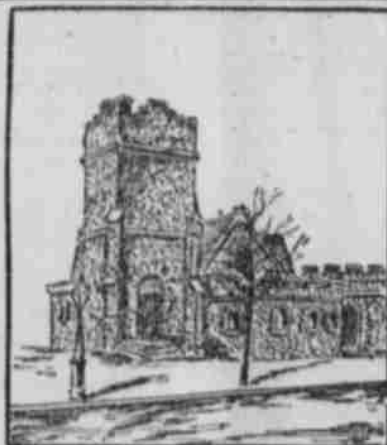
THE COBBLESTONE CHURCH.

The Unusual Edifice Built by the Elmhurst Baptists. Built of cobblestones and on lines suggested by an old monastery of feudal times the new Baptist church at Elmhurst, L. I., is one of the most novel bits of church architecture in the land. While yet undedicated and unfinished as far as the interior work