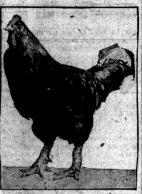
Bad Case of Scaly Leg.

Scaly leg of poultry is a common and well-known affection of chickens that sometimes causes affected birds to become worthless. It is caused by an extremely small mite that works in and under the crusts that form on the legs. Caraway or sulphur ointment will kill the mites. Scales form