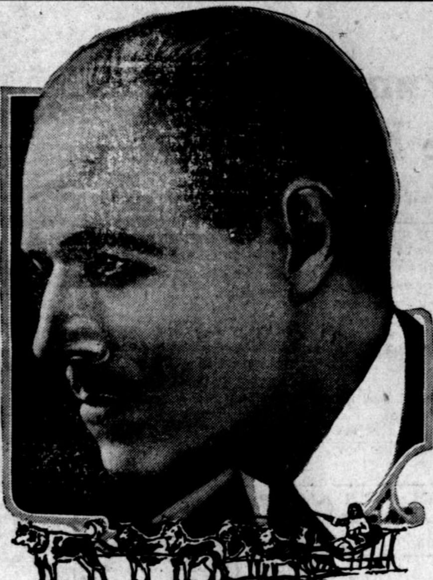
Jack Holt in the Paramount Picture "The Call of the North"

Two shows each night, 7:30 and 9:00. — Saturday matinee 2:15