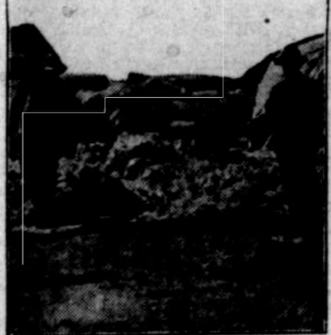
Grading Wool for a Co-Operative Shipment.