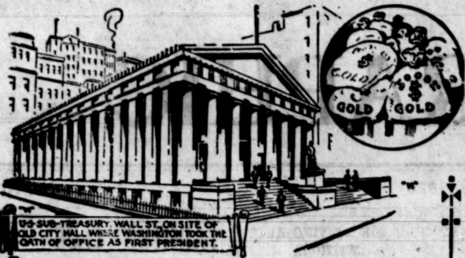
U.S. NATIONAL BANK, WALL ST., ON SITE OF OLD CITY HALL WHERE WASHINGTON TOOK THE OATH OF OFFICE AS FIRST PRESIDENT.