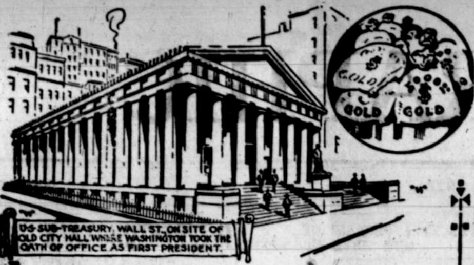
U.S. NATIONAL BANK, WALL ST., ON SITE OF OLD CITY HALL, WHERE WASHINGTON TOOK THE OATH OF OFFICE AS FIRST PRESIDENT.