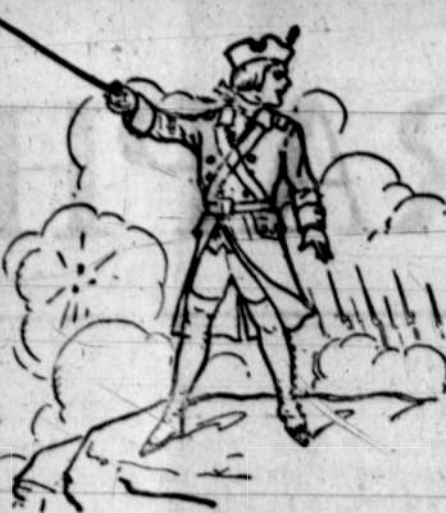
Alexander Hamilton First Secretary of the Treasury

When eleven years old he was put to work as errand boy in a bank. By study, industry and thrift he learned the business, saved enough to make profitable investments, became prominent, fought in the Revolution, signed the Declaration of Independence and was first Secretary of the Treasury.