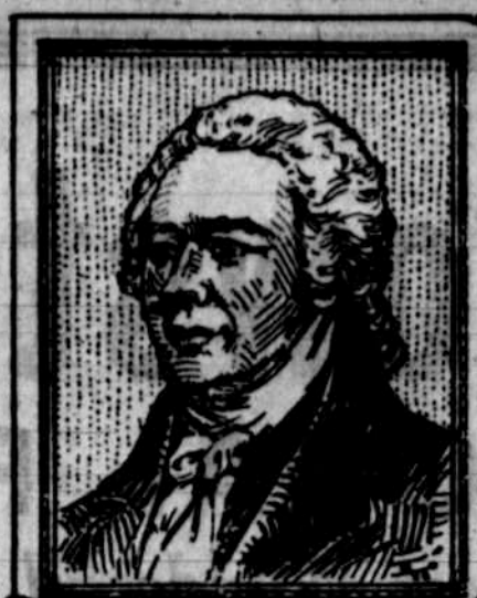
Alexander Hamilton First Secretary of the Treasury

Old Salt—Yes, sir, I fell over the side of the ship, and a shark came along and grabbed me by the leg. Visitor—Good gracious! And what did you do? Old Salt—Let 'im 'ave the leg, o' course. I never argue wth sharks.—Boston Globe.