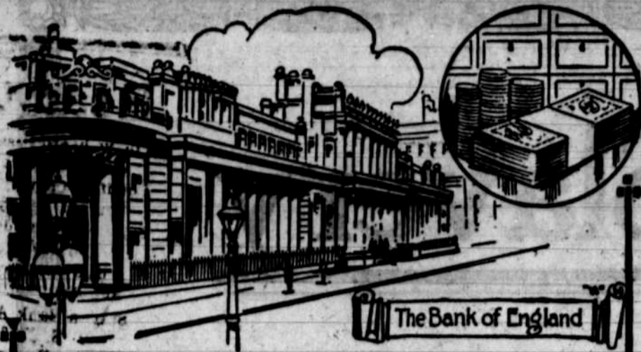
The Bank of England

No, we are not as old as the Bank of England, which was chartered July 27, 1694, but we are fully as safe and dependable as that historic financial institution has been through the years that are past.