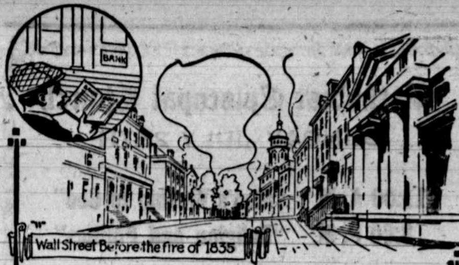
Wall Street before the fire of 1835