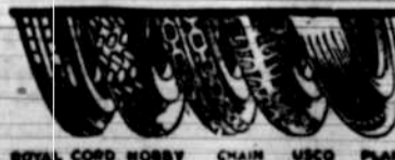
ROYAL CORD NOBBY CHAIN USCO PLAIN

Select your tires according to the roads they have to travel: In sandy or hilly country, wherever the going is apt to be heavy—The U. S. Nobby. For ordinary country roads—The U. S. Chain or Usco. For front wheels—The U. S. Plain. For best results— everywhere —U. S. Royal Cords.