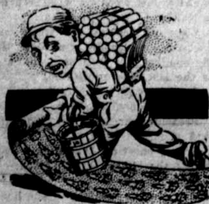
WE'LL UNROLL WALL PAPER

as long as you like, till you see exactly the pattern that suits you. We don't expect every paper we have will please everybody. But we know we have such a variety of patterns, all pretty, that we can suit anybody in time. So don't be afraid to look till you are suited. We are only too glad to show you all you desire to see. We will also hang paper at a reasonable price.