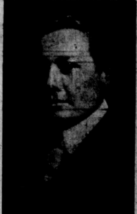
Senator Harold C. Kessinger

Youngest Man in the Country to Be Honored With Senate Title