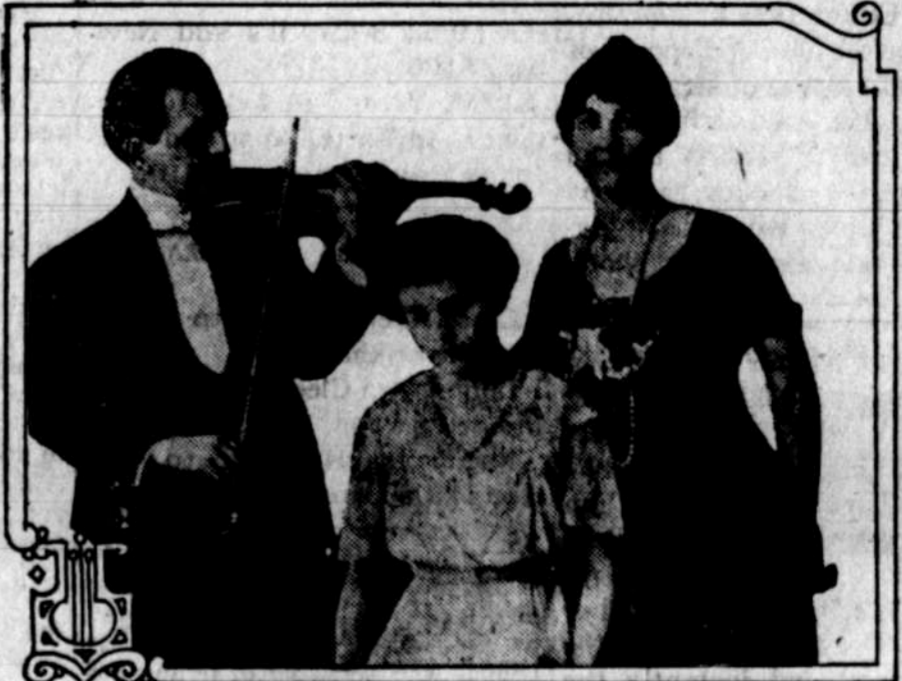
THE FILLION CONCERT PARTY.

Musical Artists Give Two Splendid Programs