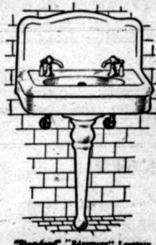
"Standard" "Economy" Lavatory

For your own interest, see this book before planning your bathroom.