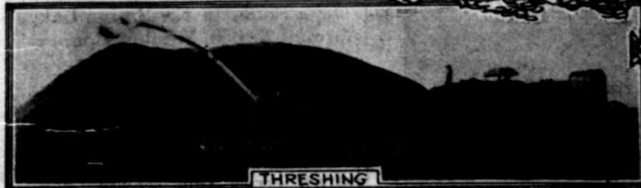
THE WORLD'S GREATEST WHEAT PRIZE $5,000.