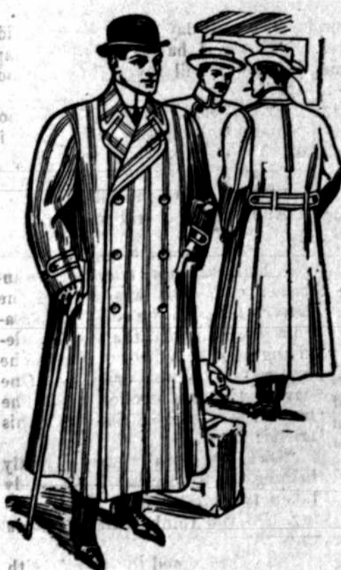
Brandegee, Kincaid & Co. Clothes

Gloves are always in demand, we have them from 25 cents to $3.00