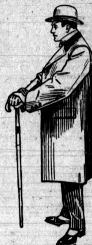
Brandegee, Kincaid & Co. Clothes.