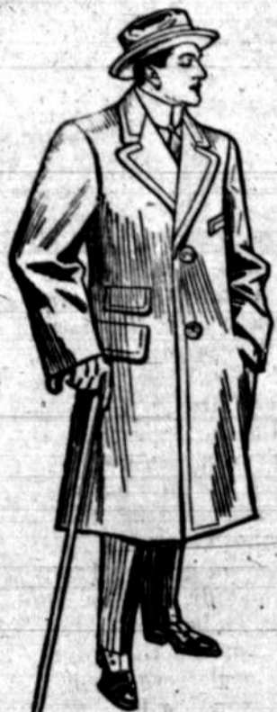
Brandegee, Kincaid & Co. Clothes.

IS IT PERPLEXING TO SELECT SUITABLE GIFTS FOR THE MENFOLKS?