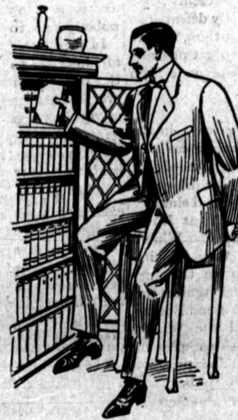
Brandegee, Kincaid & Co. Clothes

Everything for Men and Boys, Best grades at Moderate Prices