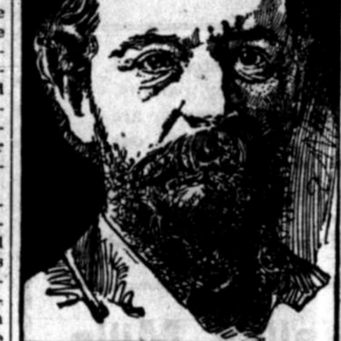
ALGERNON CHARLES SWINBURNE.