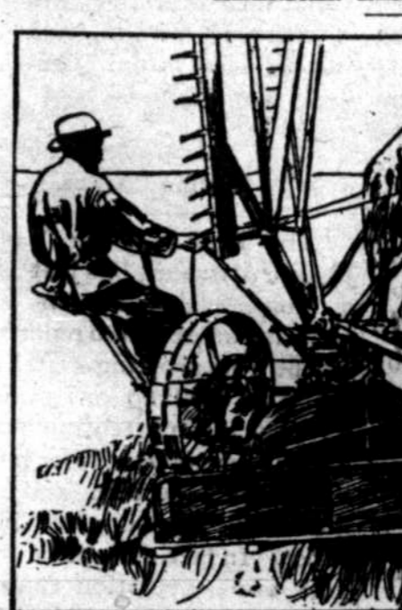
American farm machinery is rapidly finding its way into foreign countries, but our American farmers would not know how to use the machines that are sent over there. They are built to meet the demands of Asiatic farmers, who are slow to grasp up-to-date methods.

Individuality of Cows. While there are slight individual differences in digestive efficiency among cows, extensive experiments have shown that these are insufficient to account for the widely variable returns made by similar cows from like quantities of the same kind of food. The results obtained in tests of this kind are emphatic. It has been shown that, of two cows of apparently the same merit, from superficial examination one may return three times as much as the other from a given amount of similar foods. They digested their food equally well. It is a well known fact that there are individual likes and dislikes among cows, which necessitates an intimate knowledge of each cow if best results are to follow. Occasionally a cow will make her best performance upon a ration not suited to the other members of the herd. These matters are of continual interest to the dairymen, who should safeguard himself at all times by keeping at least approximate records of food consumed and product yielded by each individual.—Kansas Farmer.