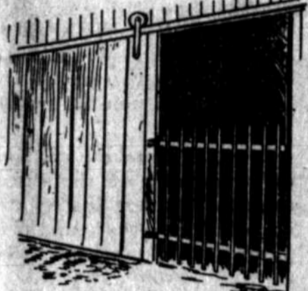
SLAT STABLE DOOR.

The gate is hinged on the rolling door with light strap hinges, explains a writer in the Prairie Farmer, so that when the gate is not in use it swings