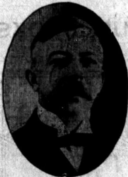
H. M. Cake, Republican Candidate for U. S. Senator