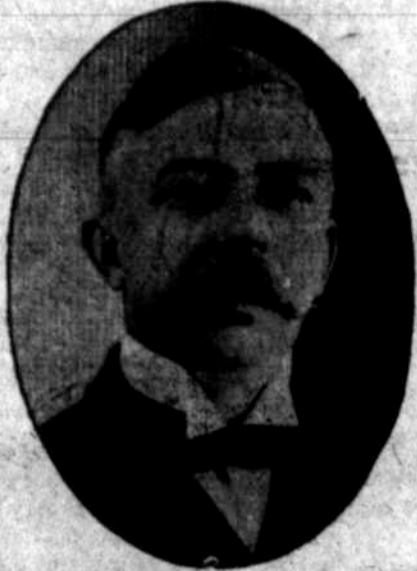
H. M. Cake, Republican Candidate for U. S. Senator

The passage of the bill for the appropriation for the support of the University of Oregon will increase your taxes a little more than two cents if you pay taxes on $1,000 worth of property, but all progressive citizens will be willing to pay this much to save Oregon from the brand of a "mossback" state.