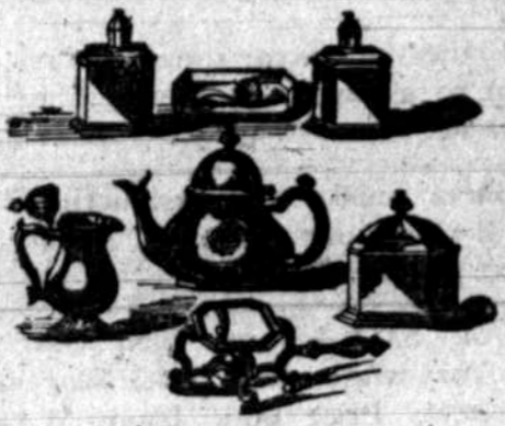
PENN'S SILVER TEA SERVICE.

whom Montesquieu denominates the modern Lycurgus. He was the son of Admiral Penn, was born at London in 1644, and was educated at Christ Church, Oxford. At college he imbibed the principles of Quakerism, and having endeavored to disseminate them by preaching in public, he was thrice thrown into prison. It was during his first imprisonment that he wrote "No Cross, No Crown." In March, 1680-81, he obtained from Charles II. the grant of that territory which now bears the name of Pennsylvania. In 1682 he embarked for his new colony; and in the following year he founded Philadelphia. He returned to England in 1684, and died in July 1718. He was a philosopher, a legislator, an author, the friend of man, and, above all, a pious Christian. In addition to the reasons above given, the sketch of the tea service is an object of curiosity, as showing the state of silversmith's work in England, at the close of the seventeenth century, for articles of domestic use.