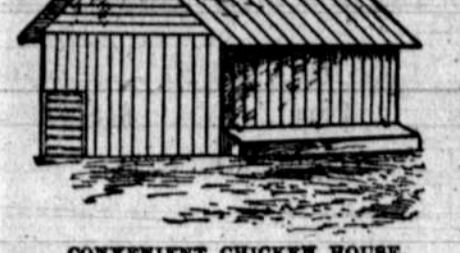
CONVENIENT CHICKEN HOUSE.

It is built of 1x12 boards, well slatted on three sides; the front has a stripped or latticed door in one corner, this to insure plenty of ventilation; the roosts are swinging poles, sus-