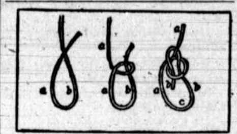
HOW TO TIE THE KNOTS.

The bow and knot is one of the most useful knots we have, and one which comparatively few can tie. It is a knot sailors use constantly. The illustration will show exactly how it is tied. Lay the parts together as in the first figure, b crossing over a. Then bring a over b, bringing the end up