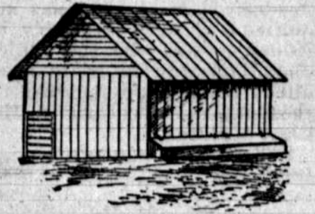
CONVENIENT CHICKEN HOUSE.

It is built of 1x12 boards, well slatted on three sides; the front has a stripped or latticed door in one corner, this to insure plenty of ventilation; the roosts are swinging poles, sus-