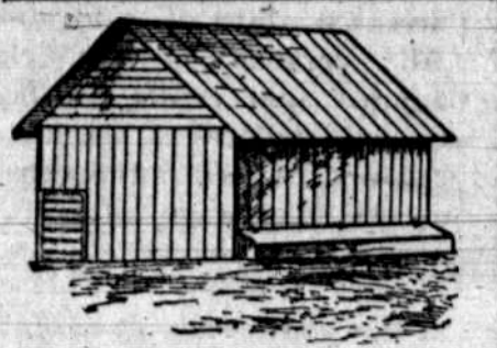
CONVENIENT CHICKEN HOUSE.

Plan for Chicken-House. A Texas woman in Farm and Ranch describes a chicken house for the benefit of any who may wish a clean, convenient one. It is built of 1x12 boards, well slatted on three sides; the front has a stripped or latticed door in one corner, this to insure plenty of ventilation; the roosts are swinging poles, sus-