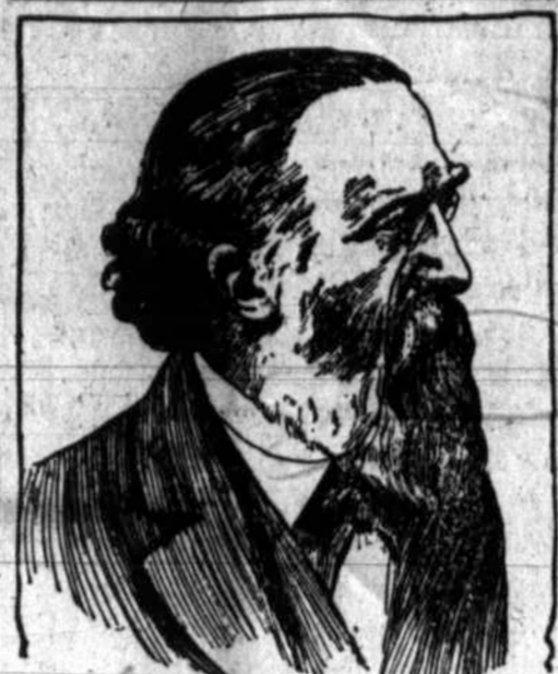
JUSTIN M'CARTRY, M. P.

Justin McCarthy is one of the foremost living men of letters. His reputation as statesman, historian, journalist, novelist and orator is world-wide. He was born in Cork, Ireland, in 1830. He early mastered the classics, and at