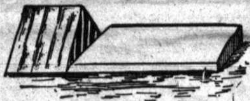
COVERED RUN FOR CHICKS.

Those who have raised chickens know that one of the troubles with which they have to contend is keeping the little ones from being drowned by