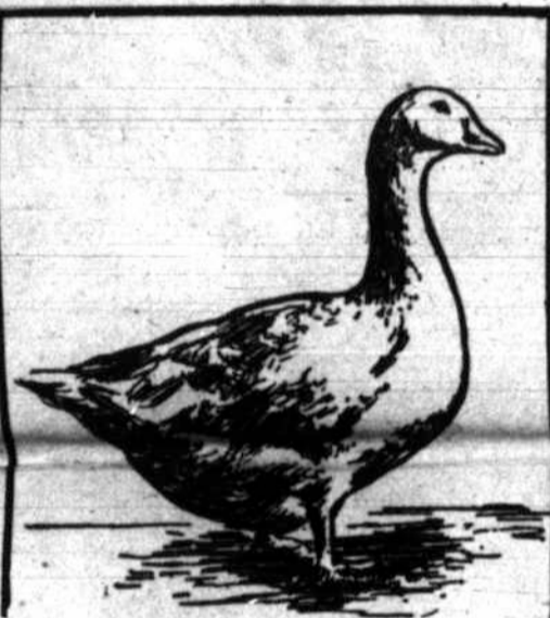
A SHAPELY GOOSE.

which is shown in the illustration, is attracting attention because of its hardiness, size and the quality of both feathers and flesh, and to those interested in geese raising is worthy of consideration.