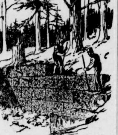
HISTORIC WALL UNCOVERED.

Idaho Mine Bonded. The Evergreen-Eureka Gold Mining Company has bonded its property at Camp Dewey, Idaho, to a Salt Lake company. The company agrees to pay $125,000 for the property, which includes the Evergreen, Eureka and McArthur claims.