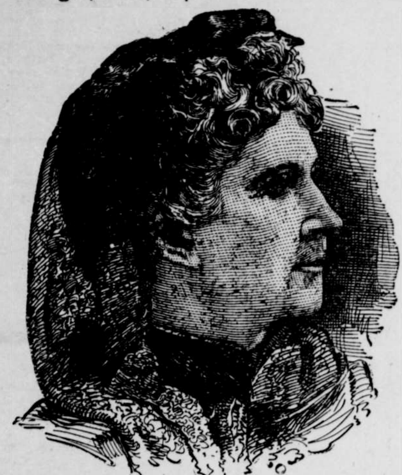
MRS. BELVA A. LOCKWOOD, LATE CANDIDATE FOR THE PRESIDENCY.

Regard Peruna as Their Shield Against Catarrh, Coughs, Colds, Grip and Catarrhal Diseases.