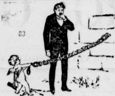
A New Obstacle.

Should we plant more shade trees and try to save a few of the native trees that are left. Many beautiful spots have been lost to the town because trees and shrubbery have been needlessly destroyed and we hope, hereafter no oak or other fine trees will be cut down unless there is a necessity for it.