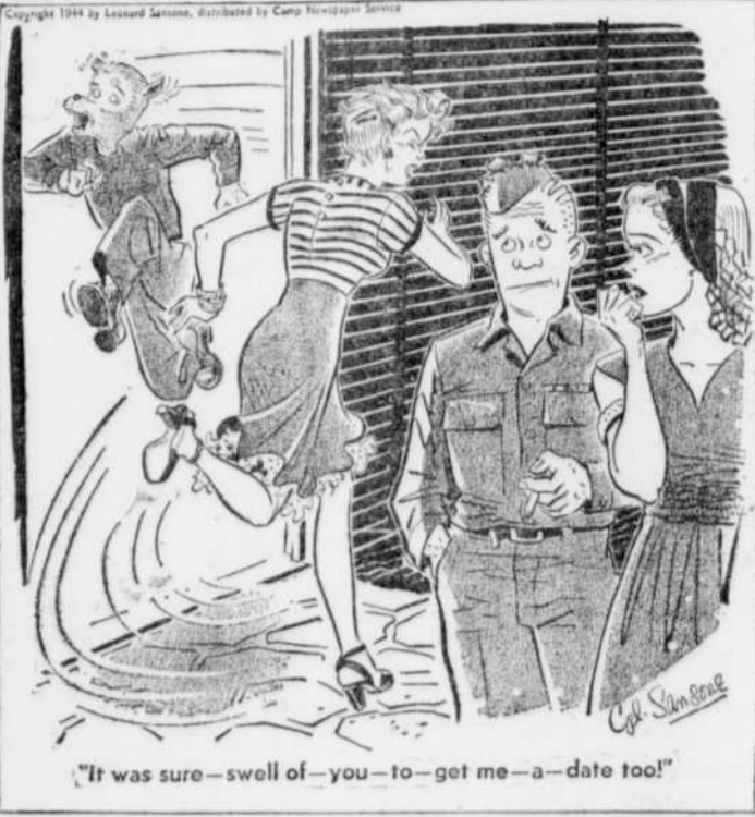
"It was sure—swell of—you—to—get me—a—date too!"