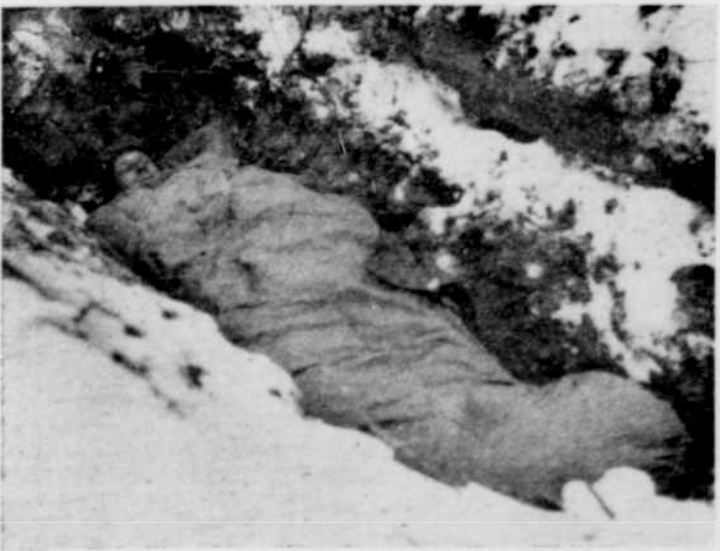
Although it lacks some of the comforts of a beautyrest, this sleeping bag used by soldiers on Camp Abbot's three-week unit training problems was cozy enough to bundle this soldier off to sleep in short order. Our man admitted something was missing all right, but he didn't have reference to a mattress.